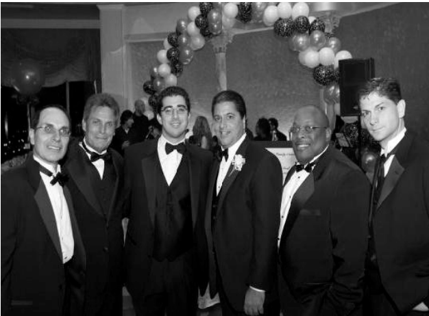
The SDS Men in Black,